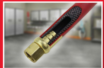
PERFORMANCE EPDM RUBBER HOSE WITH NYLON BRAID RUBBER REINFORCEMENT