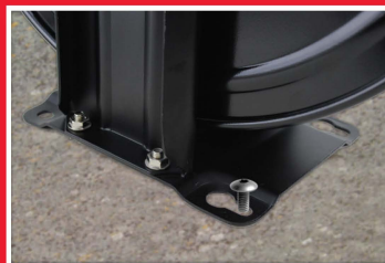
EASY-INSTALL MOUNTING PLATE WITH KEYHOLE DESIGN