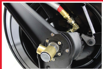
SOLID BRASS FITTINGS RESIST CORROSION AND LEAKS