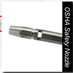
OSHA Safety Nozzle