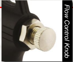
Flow Control Knob