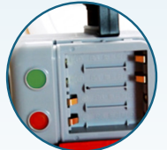
Uses 4 AA BATTERIES

COMPATIBLE LIQUIDS Gas Diesel Kerosene Light Oil