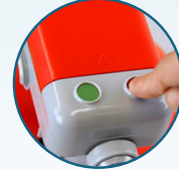
Simple POWER BUTTONS