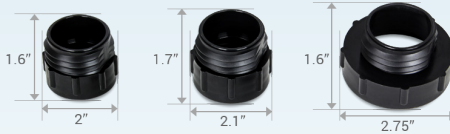
3 Different Size Adaptors