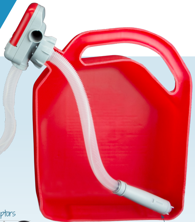
Flexible Intake Hose

Introducing the Docap TeraPump #20042, the world's first battery powered fuel transfer pump with auto-stop and leak protection. The Docap TeraPump #20042 eliminates the lifting of large heavy gas cans and spilling wasted fuel. Our exclusive design makes transferring fuel to lawn mowers, tractors, cars, boats, leaf blowers and more, painless and hassle free.