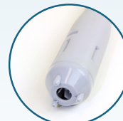
Pumps 11 LITERS p/min

Introducing the Docap TeraPump #20042, the world's first battery powered fuel transfer pump with auto-stop and leak protection. The Docap TeraPump #20042 eliminates the lifting of large heavy gas cans and spilling wasted fuel. Our exclusive design makes transferring fuel to lawn mowers, tractors, cars, boats, leaf blowers and more, painless and hassle free.